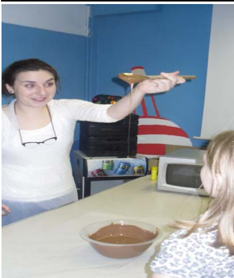
The Chocolate Making session with Cocoa Ooze was very hands on, messy and lots of fun!

The recent chocolate making sessions with Cocoa Ooze proved really popular—well who doesn't love chocolate? All those who took part got the chance to learn more about the process of making chocolate will getting messy!