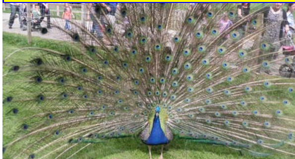
For a report on the Summer outing to Blair Drummond Safari Park, see page 2

Further information and guidance is available on the VDS (Volunteer Development Scotland) website www.vds.org.uk where you can find out more and sign up to take part.