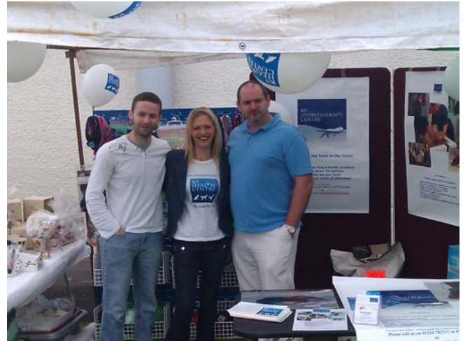
Sponsors of Portlethen Gala were K9 Hydrotherapy based at Findon.

Befriend a Child brought back Portlethen Gala at the end of August after an 8 year absence—and despite the inclement weather, the community turned out for a day of fun and games at the town's Bourtree Park and Academy. The usual range of fund-raising stalls, food, toys and gifts were available, as well as entertainment provided by Newtonhill Pipe Band, Millennium Child and The Limits Cheerleading team.