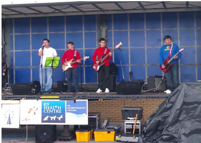
Inverurie band Chameleon were just one of the acts taking to the stage at Portlethen Gala.